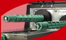
Ribbon supply and rewind module