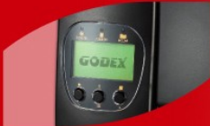
Upgrade Graphic LCD