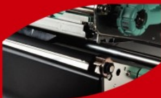
Adjustable sensor kit